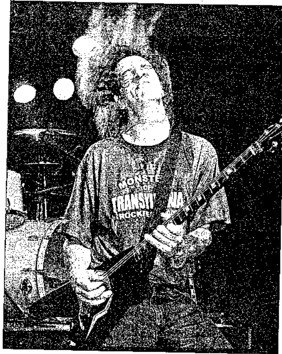
Anvil! The Story of Anvil is a portrait of one band's thirst for superstardom.

His great bid for fame was his invention of the flicker machine, a bright light inside a rotating cylinder with patterned holes. The flicker produced is said to correspond to alpha waves in the brain, and when subjects close their eyes and lean close to the cylinder, they often report a boost in alpha wave-stimulated creativity and transcen-